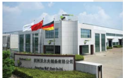
Illustration bottom right: The Chinese production and distribution site in Hangzhou