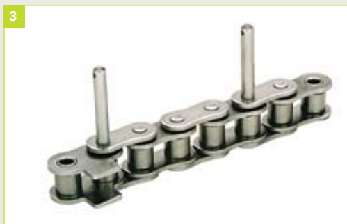
Illustration 4: Accumulation chain