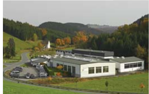
Illustration top right: Production site in Sieperring, Germany

Be it the Sauerland, Hangzhou, Atlanta or Pune – as an international company with worldwide operations, our employees are always at your service to meet your unique business needs and to provide you with industry leading technical support.