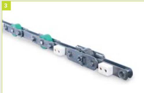
Illustration 4: Slat conveyor chain for automotive industry