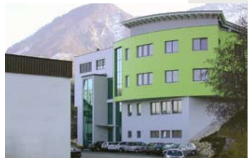
Illustration center right: KettenWulf in Ferlach, Austria