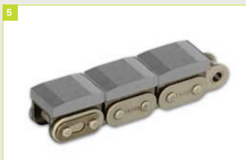
Illustration 6: Quadruplex roller chain