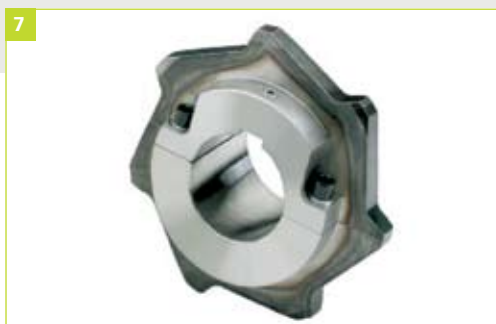
Illustration 8: Pinion sprocket