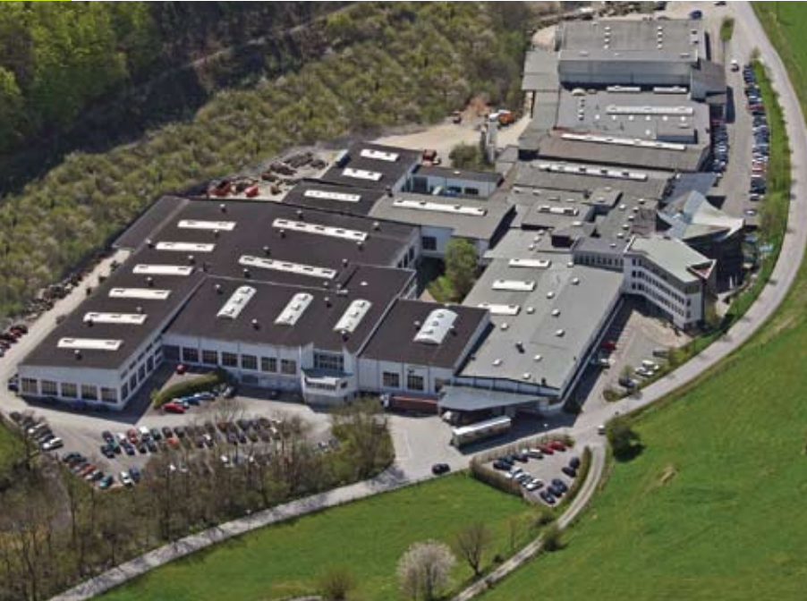
The headquarters of the KettenWulf Group in Kückelheim

For over 80 years, KettenWulf, as an expanding global company, has stood for quality, reliability and flexibility. More than 1200 employees develop, produce and market customized solutions in the field of conveying and drive technology at ten locations across Europe, America and Asia. All around the globe, KettenWulf is your strategic partner when it comes to delivering optimum product quality.